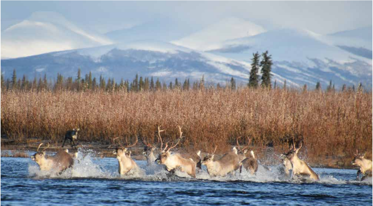
Figure 1: Caribou starting to cross the Kobuk River on their southward, fall migration in northwest Alaska, USA.