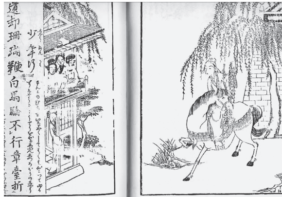
Illustration by Katsushika Hokusai on “Ballad on a Happy Young Men” 13

A young man, when bidding farewell with prostitutes, found that he lost his horsewhip and thus plucked willow twigs as a horsewhip. An ancient Japanese painter illustrated Tang poems. The following is an illustration on Cui Guofu's poem.