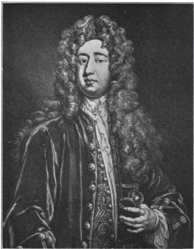
CHARLES, FOURTH LORD MOHUN, AT THIRTY