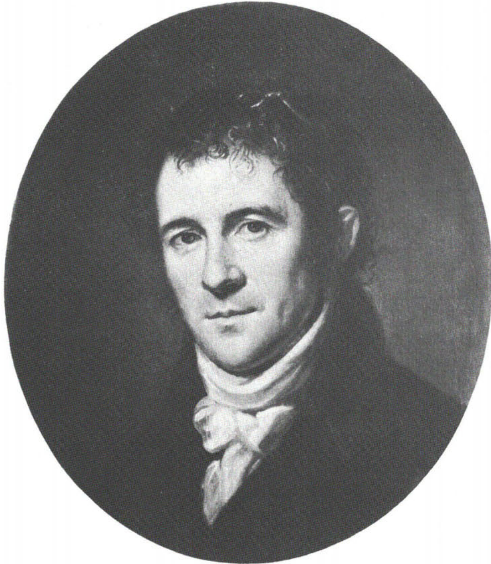
BENJAMIN HENRY BONEVAL LATROBE Portrait Attributed to Charles Willson Peale