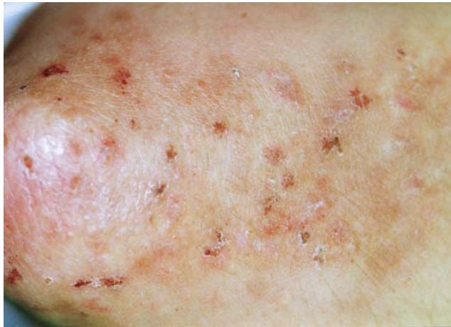
Figure 2. Dermatitis herpetiformis appears as grouped papulovesicles (0.2–0.6 mm diameter) in several 1-centimeter-wide clusters on the exterior surface of a patient's elbow. Mild postinflammatory hyperpigmentation is also noted. Focal excoriation correlates with the patient's pruritus.