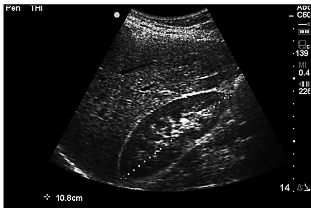
Figure 3. A sample ultrasonographic image of the sagittal right kidney made by a second-year osteopathic medical student at Lake Erie College of Osteopathic Medicine-Bradenton in Fla. An image of this anatomic structure was among 10 ultrasonographic images each student was required to make of the abdominal region.