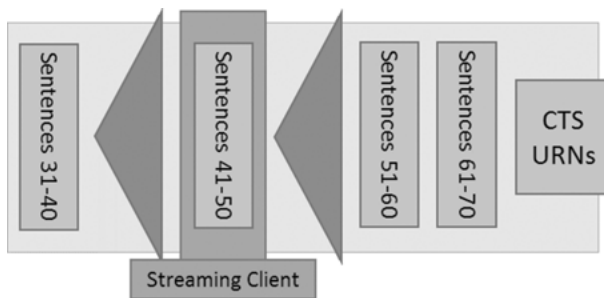
Figure 1: CTS URN based text streaming.

Because of the hierarchical properties of CTS URNs, they may also allow specific caching techniques. Generally, books tend to include more text than can be shown on a monitor in a reasonable way. If a text passage is too big to be visualized as a whole, it may be more memory efficient to use a sliding window that spans some of the smaller text parts on a lower depth that correlates to the amount of text that is visible in one moment. This streaming technique can be especially valuable when working with systems that do not have access to vast amounts of access memory like smart devices or small notebooks. Figure 1 illustrates this by showing how sets of ten sentences are processed at one moment instead of the complete text.