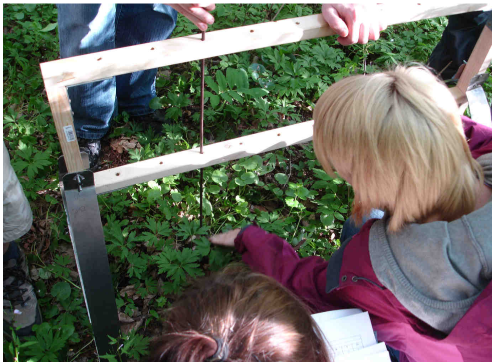
Fig. 1. Student working with Levy bridge - wooden frame with ten holes designed to estimate plant abundance

dissimilarity was treated as the overall beta-diversity. All statistics were computed per pair of methods on the site.