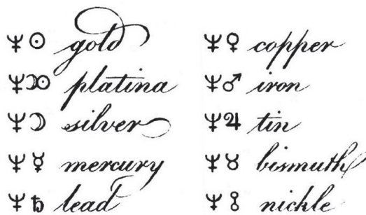
Figure 2. Bergman's symbols of the chemical elements (1785). 3 Although the symbols are unaltered from the cited source, their layout has been modified.

Not long after Bergman, English chemist John Dalton (1766-1844) introduced new set of symbols for elements in A New System of Chemical Philosophy (1808-1810). As a reference to spherical atoms, Dalton