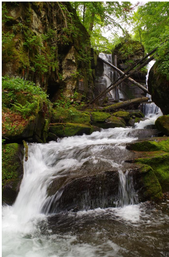
Fig 3: Sampling site No. 10: Vojvodina Waterfalls - Tur'ya Polyana.