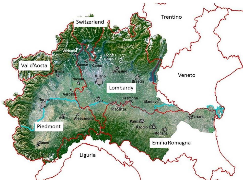
Fig 2. Administrative boundaries of the Po river basin and of the Northern Italian regions, and main urban areas.

mechanics, textile and clothing, and food. The value added produced by this last sector in the Po basin accounts for 41% of the sectoral value added in Italy 11 .