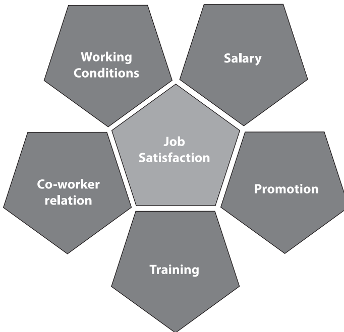
Fig 2. Job Descriptive Index

The purpose of research is to study the effect of the above 5 independent variables on job satisfaction and also rate them respecting their impact on job satisfaction.