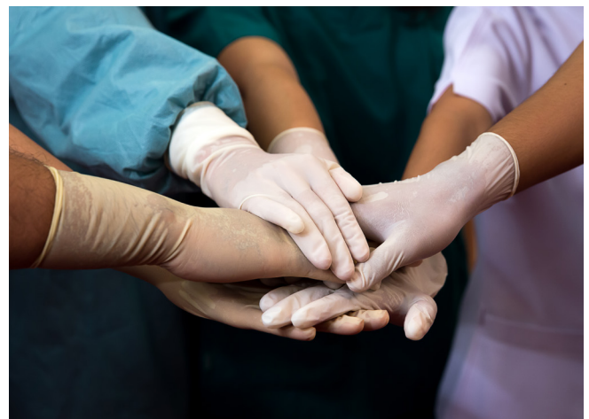
Image: Team spirit

Coagulation disorders are rare, and people with haemophilia can experience severe health issues during their lifetime. When accidents or trauma occur, there is a greater risk of mortality in this population, with intracranial haemorrhage being the most common cause [1] . Seizures, psychomotor impairment, statomotor