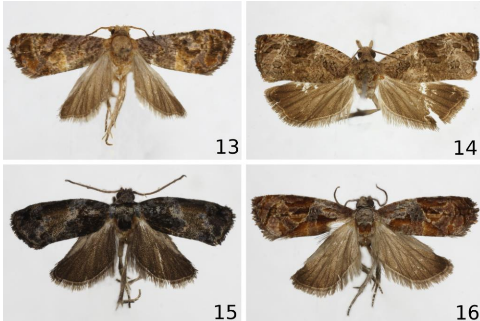
Figs 13-16. Adults: 13 – Lobesia uncata sp. n., holotype; 14 – Megalota submicans (WALSINGHAM), Brazil; 15 – Eumarozia atrotincta sp. n., holotype; 16 – Zomaria dystricta sp. n., holotype.