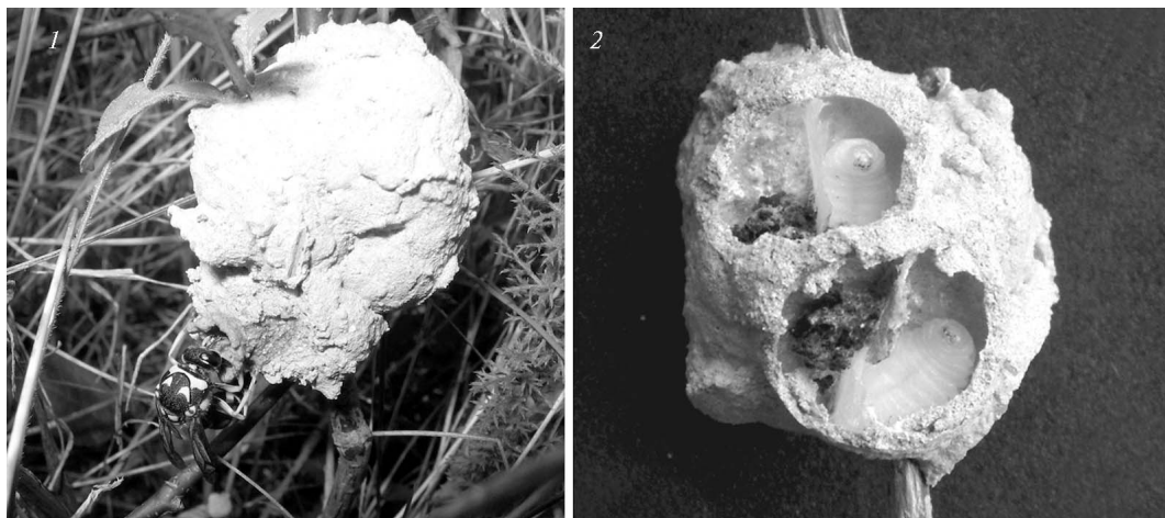
Fig. 1. Nesting of Eumenes punctaticlypeus kostylevi : 1 — the nest N 2 attached to a bush stem with female constructing the cell collar; 2 — the same nest dissected after exposition; one can see two-layer cocoons with lumps of preys’ remains and preys’ feces between layers and prepupae inside the inner layer.

The nest N 2 was attached to a bush stem in the grass layer and consisted of six cells made of biscuit soil mastic. In the moment when the nest had been found, a female was building the collar of the sixth cell (fig. 1, 1). The nest was transported in the laboratory where it was examined. It was 28 mm in the long axe (along the stem) and 26 mm