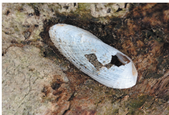
Fig. 2. Right valve of mollusc B. candida , found in Ukrainian part of Danube delta (19 October, 2016).