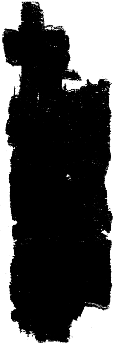
Abb. 1. P. Berol. 9813